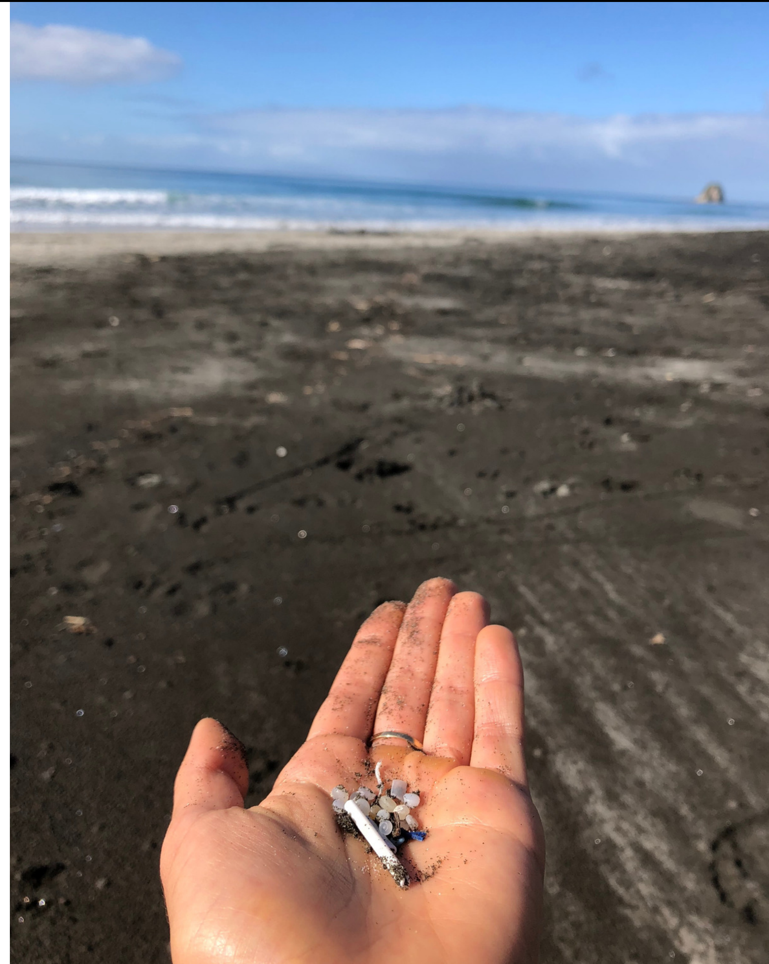
Photo taken on Mangawhai Beach, July 2018.

'Nurdles' pre-fabrication plastic pellets and micro-plastics on the high tide line.